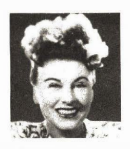
HILDEGARDE, star of radio and supper clubs, "I like ELLERY OUEEN'S MYSTERY MAGAZINE because it is so exciting and I like exciting things. I often carry it around with me to read on trips or at other times when I have a free moment or two. Please renew my subscription."