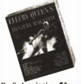
By Subscription $3 a year