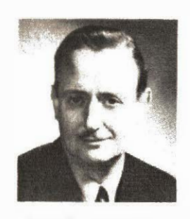
JOHN DICKSON CARR, famous mystery writer. "What I look for is not a clumsy concoction of boy-meets-girl-with-detective-incidents, but a detective-incidents, but a detective story with an original idea. That's what I find in every issue of ELLERY QUEEN'S MYSTERY MAGAZINE That's why I think EOMM is the best detective magazine in the business."